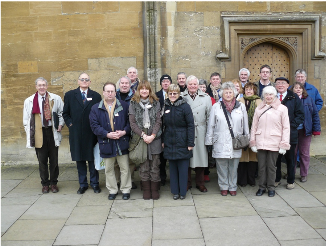
Meet & Share – The Church Wardens from Parishes in Maidenhead & Windsor Deanery in the Tom Quad Oxford

Church wardens across the Deanery took part in a Meet & Share event in January 2009, visiting Christ Church Cathedral and discussing ways of facilitating collaboration across the Deanery. Various ideas were hatched including the suggestion of twice yearly meetings between Church Wardens across the Deanery, and a web chat room to allow sharing of ideas and provide a forum for discussion.