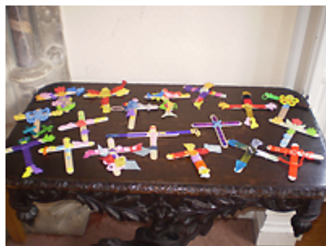
Annual Report 2007