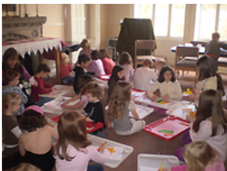
All Saints, Boyne Hill

Our future aspirations have not changed that much from last year. It is a slow but rewarding task to build up the Godly Play resources. Our teachers are doing an excellent job which is reflected in the numbers of children coming through our doors. And this brings us back to the usual question as to how we continue to cater for the increasing numbers.